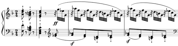
Figure 6: Beethoven's piano sonata no.6, m.40–43.